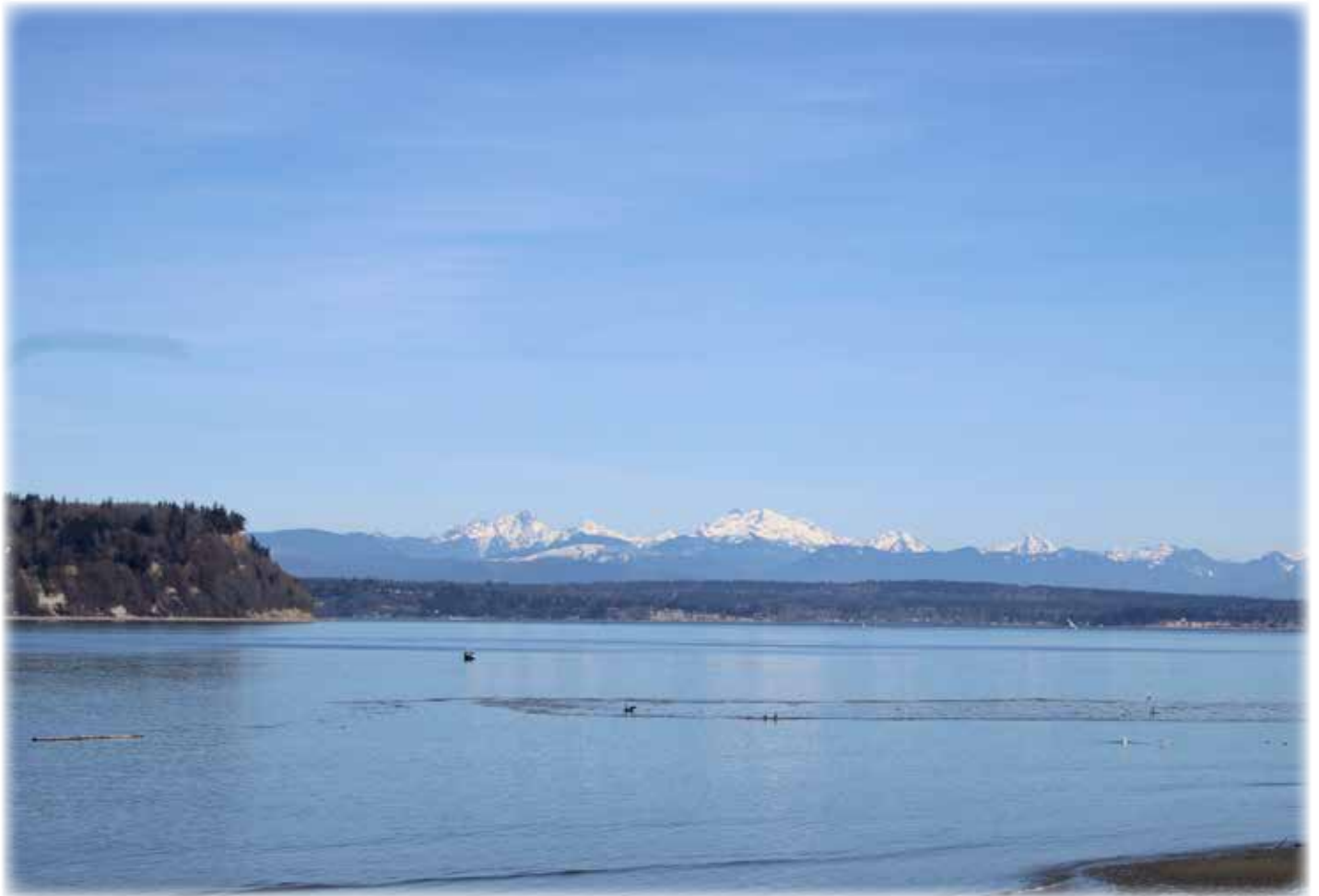
Langley, Washington on Whidbey Island