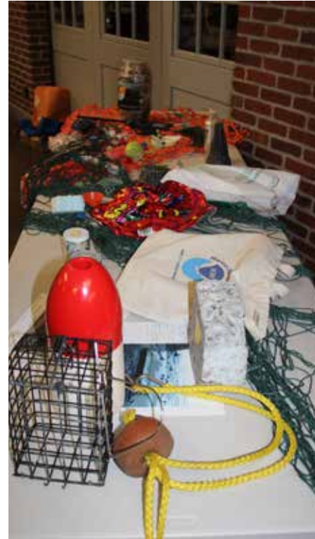
Trash found in the ocean and sound