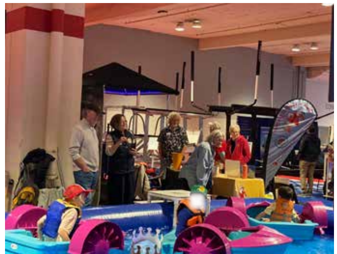
Photos from the Boat Show, Boating Safety 4 Kids