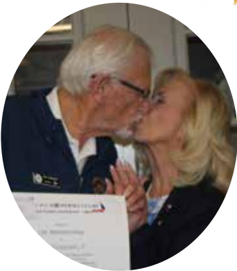
Good Husband Award