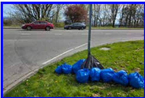
Trash bags full of street garbage