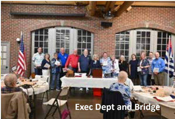
Exec Dept and Bridge