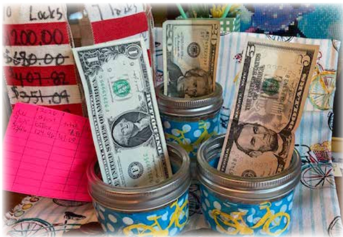
Bike Fund Jars

Date August 15 from 1:00pm to 5:00pm Location: Next to Banner Bank We set up a booth and teach about life jackets, cold water and the rescue bag. Need five volunteers