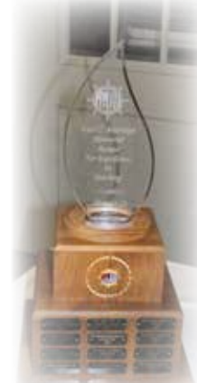
Excellence in Education