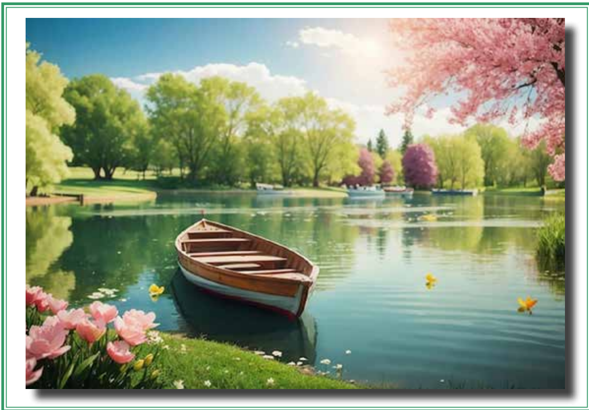
Spring in Bloom Microsoft Bing