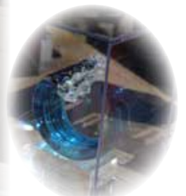
2024 Civic Service Award