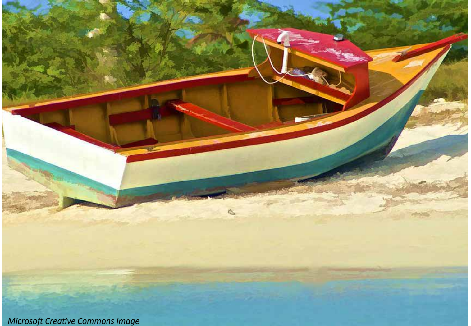
Microsoft Creative Commons Image