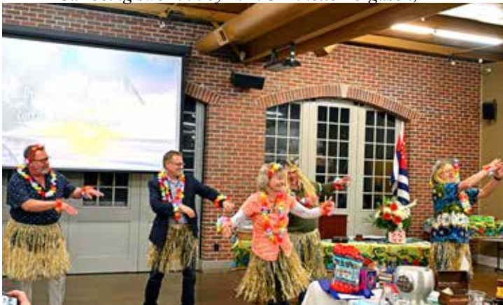
Entertained by The Bridge, The Hoola goes on...