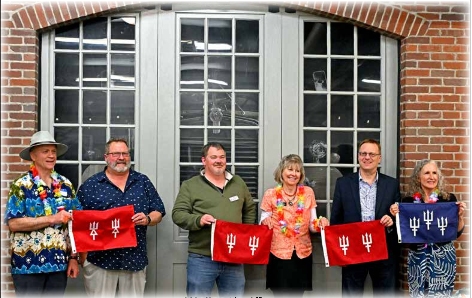
2024/25 Bridge Officers