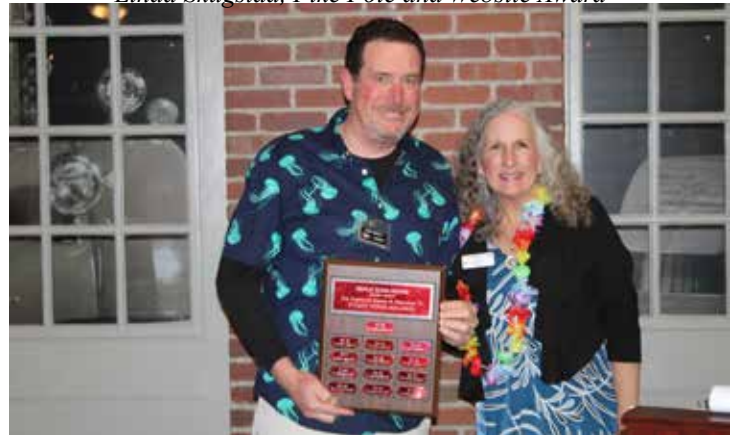
The Merle Bunn Award