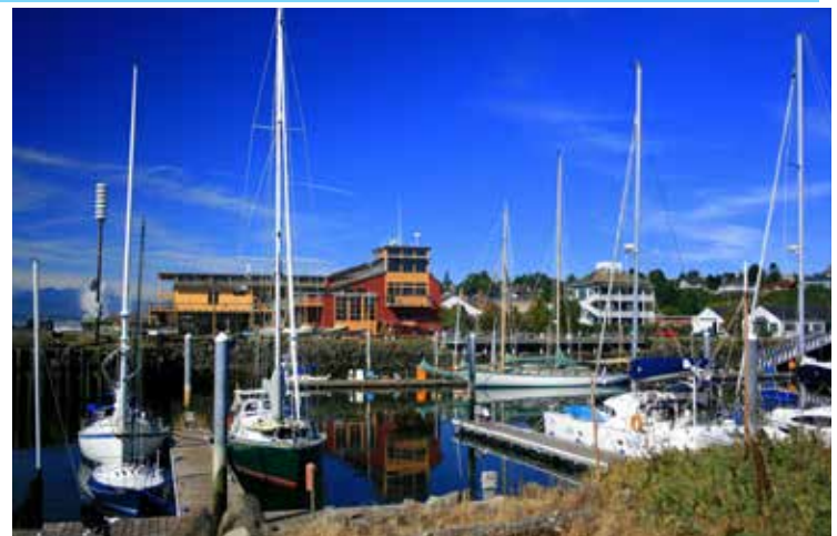
Point Hudson Marina in Port Townsend, WA

It is important to sign up at least 1 week prior to ensure we have enough materials.