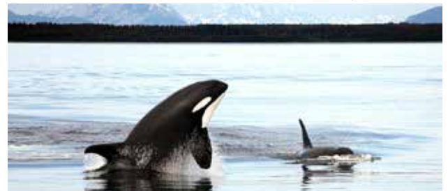
Stay 400 yds from orcas and 100 yds from all other marine mammals.